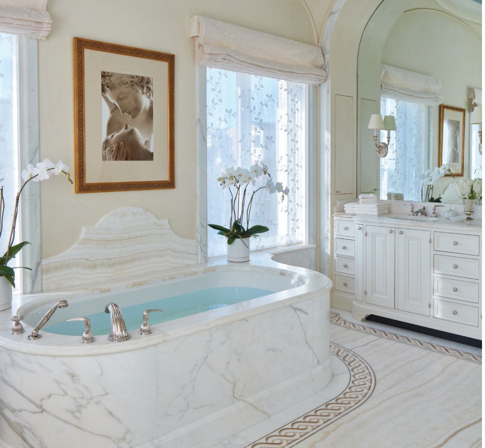
In the primary bathroom a Calacatta marble tub sits amidst the intarsia floor.

have been unbelievably difficult. It's a stair in a classical design that couldn't have been made to withstand the major seismic forces before the 21st century."