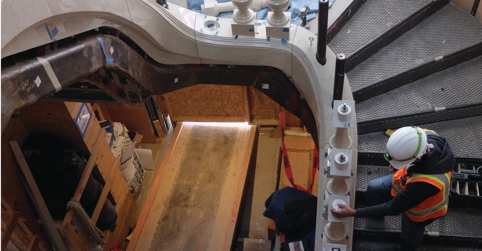
Each individual balustrade was carved in Italy, and each is unique. The steel rods had to be tightened down back and forth and up and down to pull everything into alignment to make sure the structure didn't drift. The entire process of the staircase element took nearly five months.