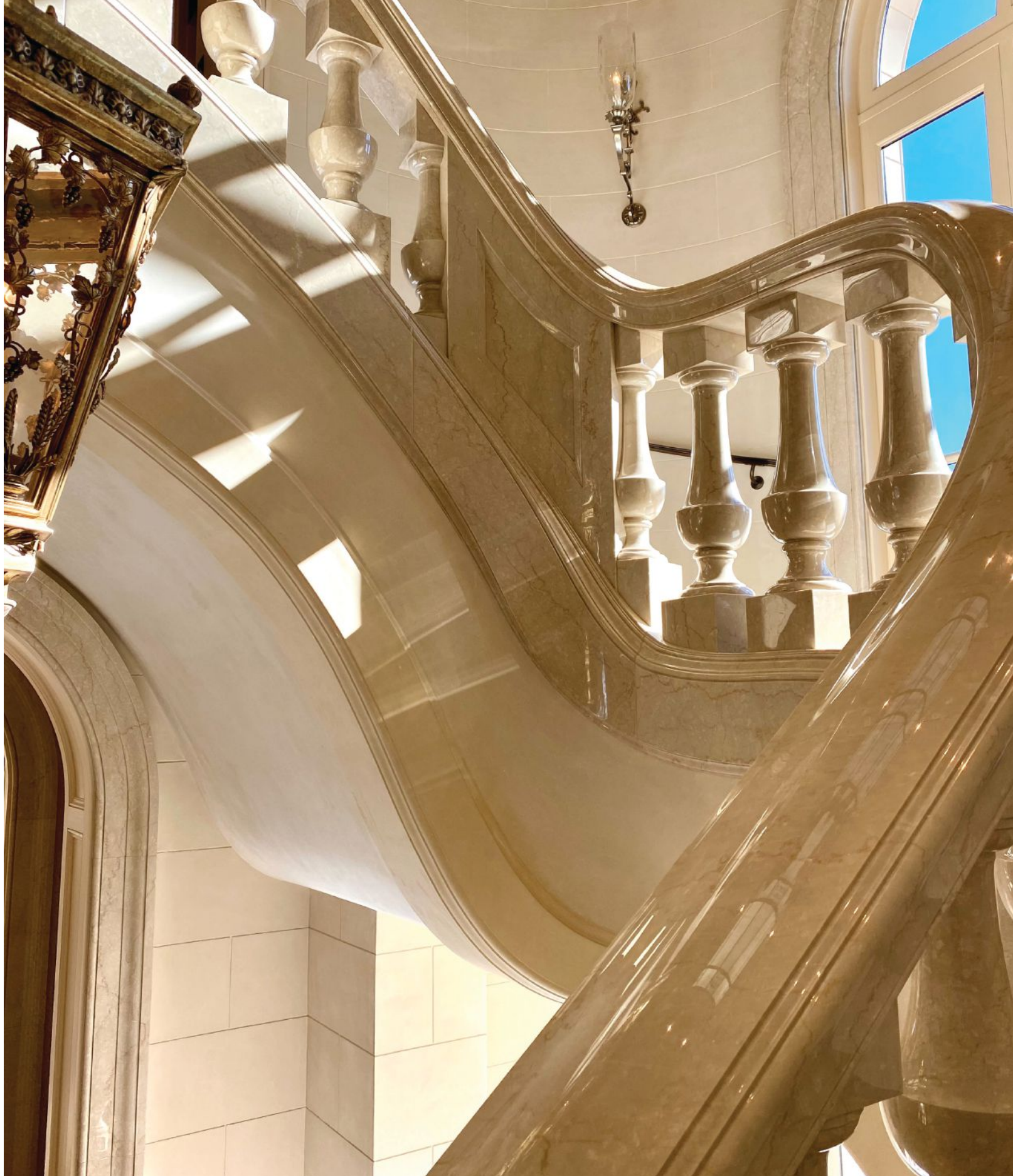
The windows, a fixed element, made the stair design challenging. The 3-D model revealed the difficulties of curving the staircase and hitting perfect alignment with a window frame. If the calculations were off, even slightly, the crew would have to go back down to the beginning to figure out the correct geometry.