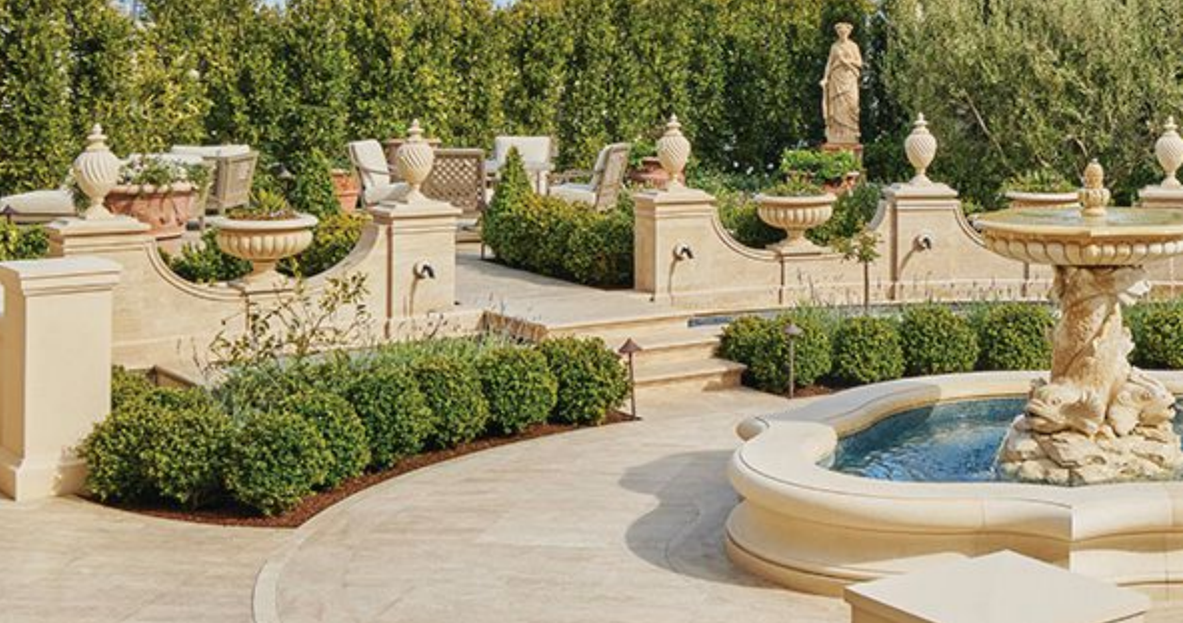
A view from the house illustrates the central stone fountain, the carved bench and the double arc of symmetrical fountains surmounted by tazza urns and finials all silhouetted against a dark background of a dense Magnolia 'Little Gem' hedge.

and extremely accurate scanning devices. Several graduate students and their professor brought their technology to San Francisco and “went through the whole steel frame with a device that looks like a vacuum cleaner. We had a perfectly scanned model,” Westbrook says.