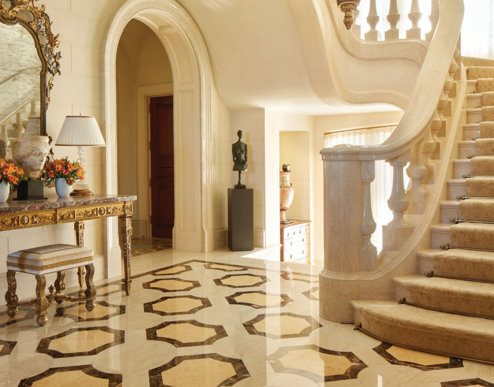
This staircase is the center of the home in terms of design and circulation. Building it was a collaborative effort among designers, engineers, masons, and technology professionals. Just building the staircase and railing from bottom to top took a five-person crew nearly two months.