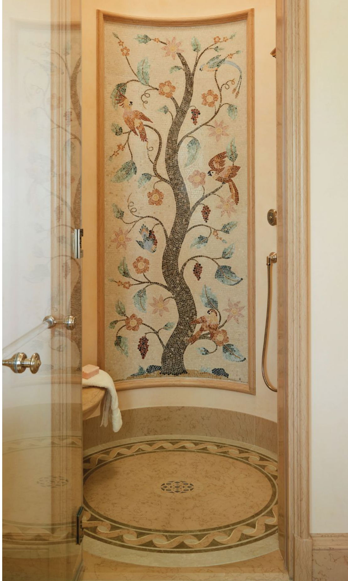
The shower in the upper floor’s home office is one of the home’s five bathrooms. It features a tree of life design and is one of the many mosaics done by Sausalito artist Pippa Murray. The colors and design are inspired by historical Italian palazzos and they pick up the other stone colors in the space.

Their final color choices, Tucker says, were “guided by a desire to fit the home’s Italian vernacular, but they also